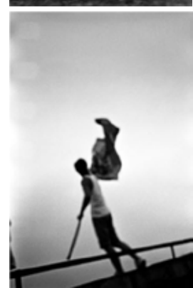
Pride, 2004 video (multichannel installation) 69x45 cm