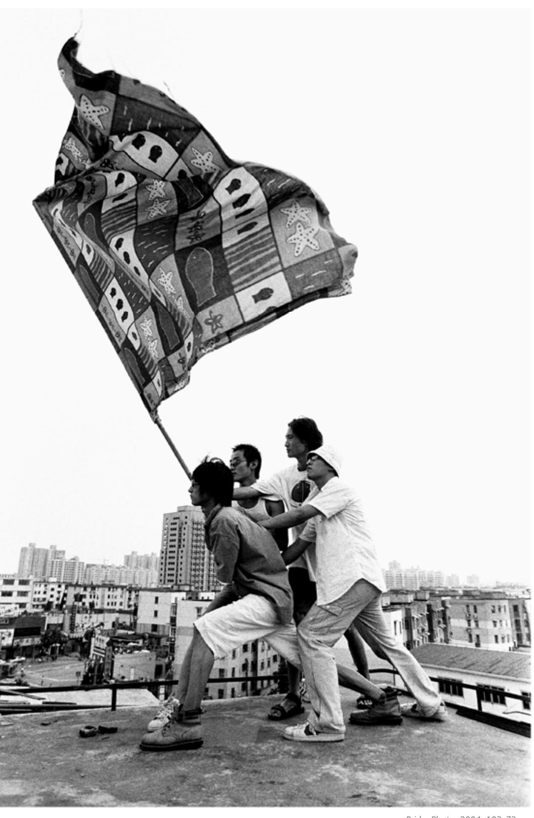
Pride, Photo, 2004, 103x73 cm