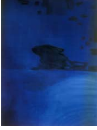
New Hydroiogical Survey No 1, 2002 Ink color on canvas, 180x140cm