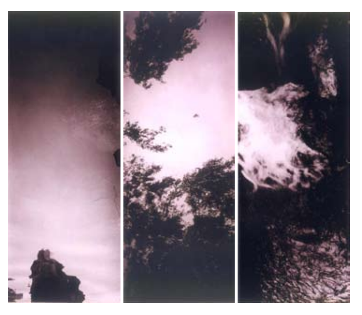
Water, Photo, 2000, 200x70 cm

Tang Guo has been able to create a very particular universe within the traditional media of ink painting and calligraphy, which only lately has been expanded to include photography. In his ink painting on canvas, color is the basic element out of which a rigorous and poetic pictorial proposal is made. Although at first glance it may suggest certain similarities with abstract expressionism this soon gives way to meticulous and warm compositions. Ranging from the miniscule to the large, Tang Guo's abstract paintings of monochromatic fields change gradually from profound blue to intense shades of red. Tang Guo shows a clear interest in the relationship between color fields that here and there mix up and interact, expanding their own limits. The beauty of the work arises from the harmonious color graduations, achieved by means of the laws of ink painting. Tang Guo has a predilection for repetition, but although the works depend on one another, they function better independently. Each brush stroke is unique, hazardous and unrepeatable, zealously searching on apparent simplicity; despite the reduced color range – color becomes a very strong element in his work.