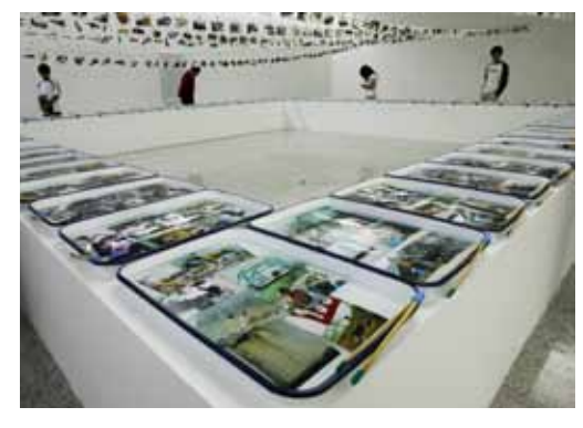
清洗 • 新闻水 / 2007 Washing • News Water / 2007