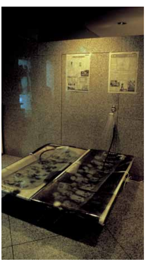
清洗•1941 大同万人坑 / 1995 Washing • Datong Mass Graves, 1941 / 1995