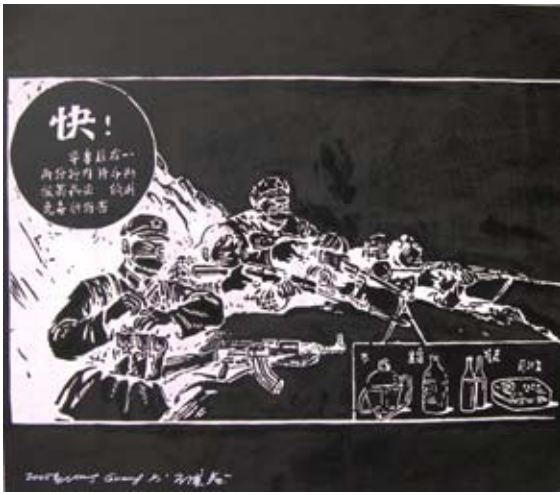
Eternal Rays, 2004 Oil/Acrylic on Canvas 130x150cm