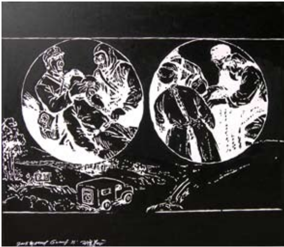
Untitled, 2005 Oil/Acrylic on Canvas 130x150cm

Wang Guangyi's aesthetics entails sampling of various imagery (such as well-known propaganda-images and photographs), and fusing them with corporate brand-names in order to undermine their original purpose. In combining ideology and advertisement, he criticizes the apparent 'truths' of both. In short, he marks the Socialist Realist iconography and symbols with another contradictory discursive system. The paintings are meant to show that though the two systems are not united, the principal goal of each is to convince the population of the authenticity and singularity of its products. The artistic strategy produces imagery on different levels, both symbolic and real, visualizing and actively counteracting key economic paradigms and their social and cultural implications.