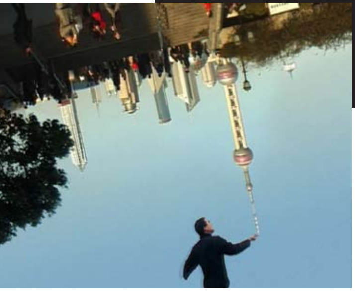
Light and Easy, Video (single channel), 2002, 1 minute

Born in Xiaoshan in 1968, Yang Zhengzhong now lives and works in Shanghai. He graduated from the oil painting department of the China Fine Arts Academy in Hangzhou in 1993, and started working with video and photography in 1995. Yang Zhengshong's work has showed at all major biennales and triennials such as Venice (2003), Shanghai (2002), Guangzhou (2002), and Gwangju (2002).