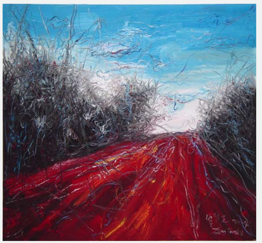
Countryside No.5, Oil/acrylic on Canvas, 2004

IN the beginning of his artistic career Zeng Fanzhi painted apocalyptic, expressionist images, thus manipulating modernist compositional effects to intensify his sinister version of reality. His representational work reveals the place of the unconscious, the aberrant, in the construction of experience. The large, clenched hands of his subjects are almost more conspicuous than their stereotyped faces and wide-open eyes. Transcending narrative resolution, these images simply unfold. What Zeng Fanzhi re-creates in his art simulates the fatigue of contemporary experience: the rush to acquire and consume, just to the extent of feeling increasingly alienated and detached. Working in idiosyncratic ways, he reminds us how effective art can be when it collapses these varieties of experience. He traces the eruption of the corporeal into the optical sedition of visual art.