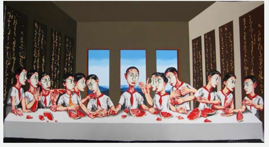
Lat Supper, Silkscreen Prints, 2002, 66x120 cm