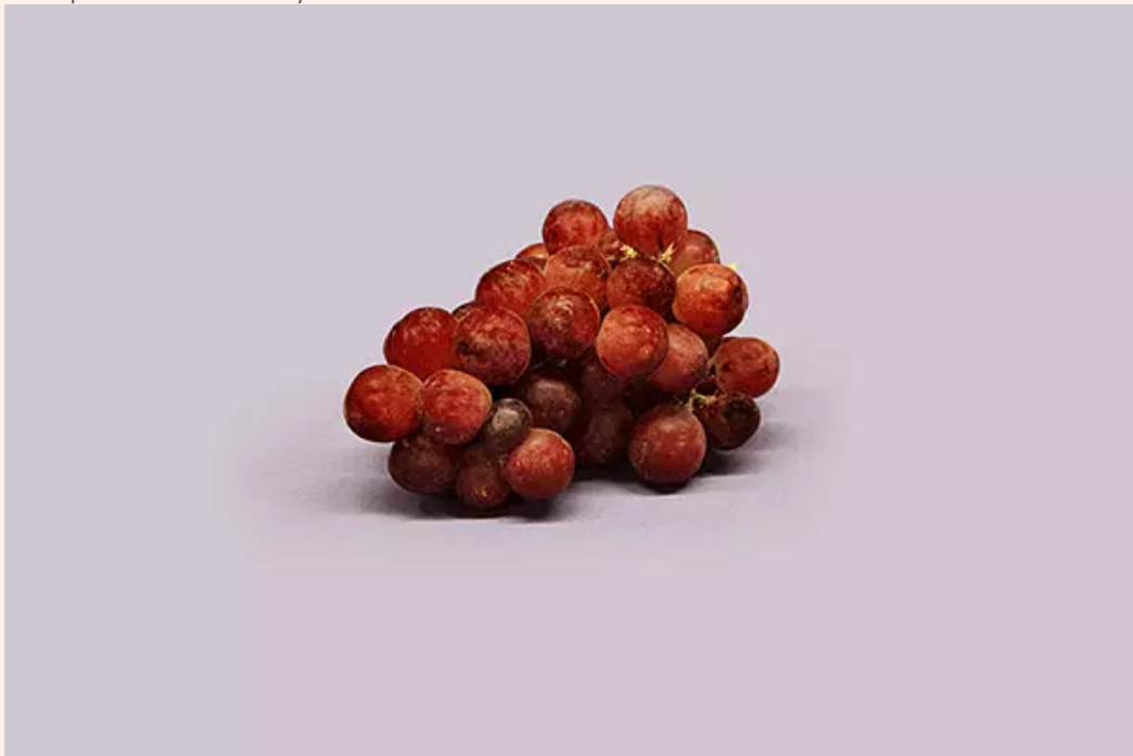
Artificial grapes made from gelatin, grape flavouring and artificial colouring have been passed off as real in roadside markets in China