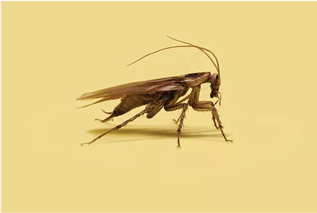
Remote-controlled cockroach © Robert Zhao Renhui

The specimens here are the result of, or under consideration for, some form of scientific modification.