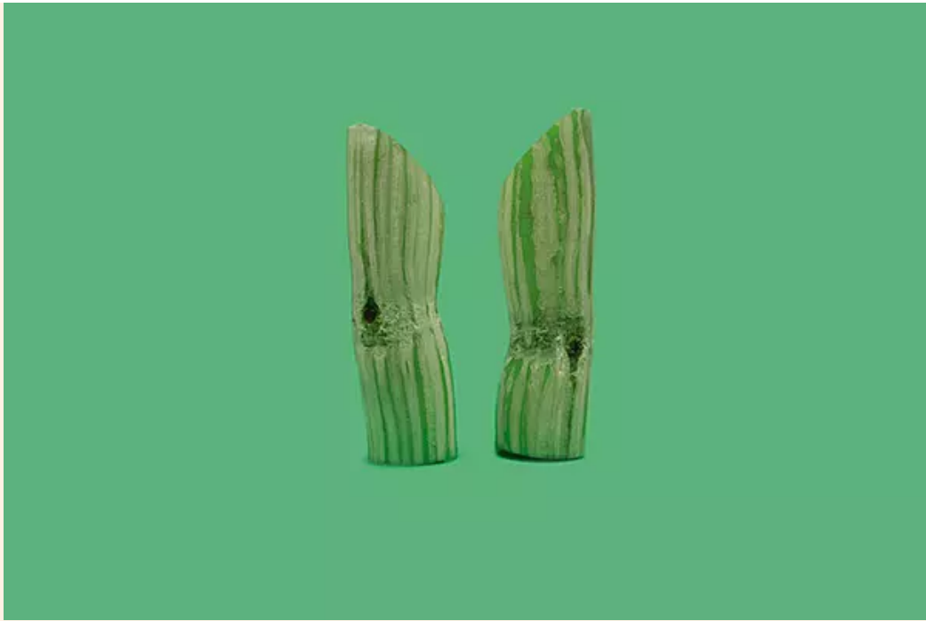
Sugar cane engineered with human gene