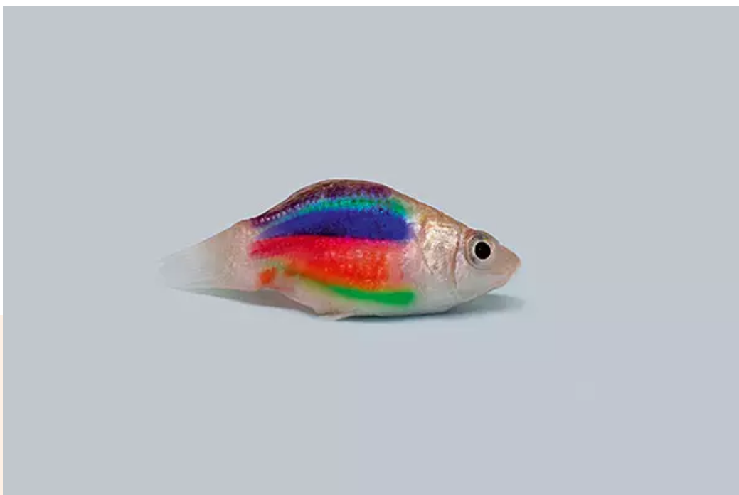
Painted Molly, Rainbow Star Warrior variant © Robert Zhao Renhui

For a recent project Zhao Renhui considered the increasingly ill-defined boundaries between the natural and the man-made.