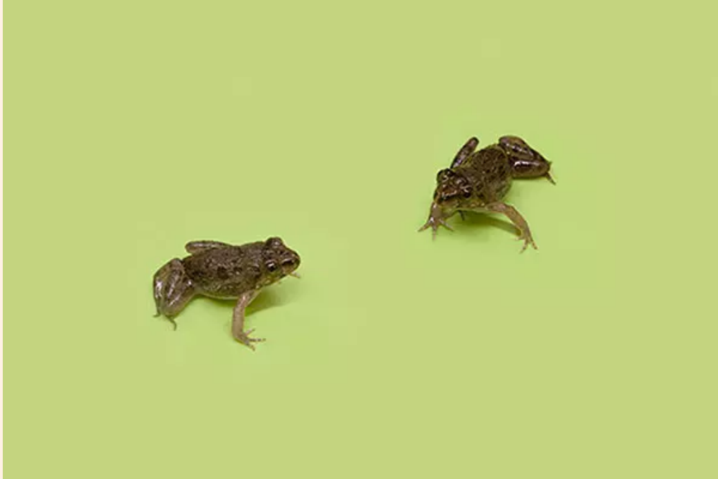
World's smallest man-made frog

“Why, for example, doesn’t the goldfish have a scientific name?” he asks. “Bred as pets for thousands of years, it is not included in any natural history encyclopaedia.”