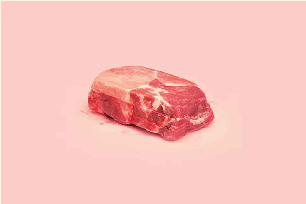
Fake beef. In China, pork has been made to look and taste like beef by adding 'beef colouring' and beef extracts