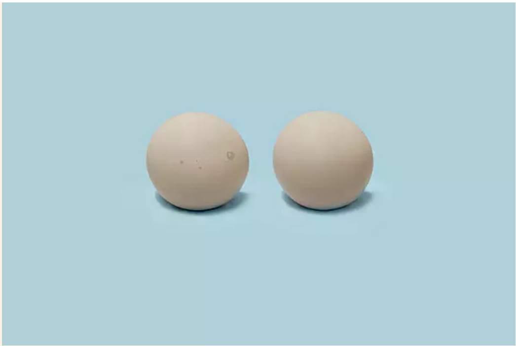
Medicinal eggs with extractable antibodies against cancer