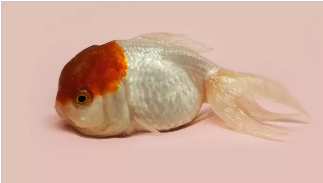
World Goldfish Queen. At the International Goldfish Championships, goldfish are judged by breed, body, shape, colour and overall impression. The winner in 2012 was this giant specimen, which weighed in at almost 4lb DECEMBER 31, 2015

The Singaporean artist has created an alternative encyclopaedia of genetically modified species of animals and plants