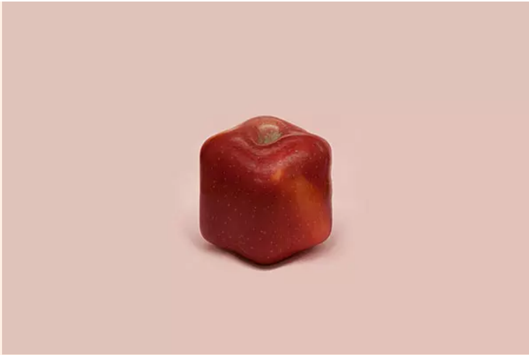
Square apple. Sold in a South Korean department store as a gift for students taking the College Scholastic Ability Test, these cubic fruits are sometimes inscribed with the word 'pass' or 'success'. They are created by stunting their growth under glass cubes