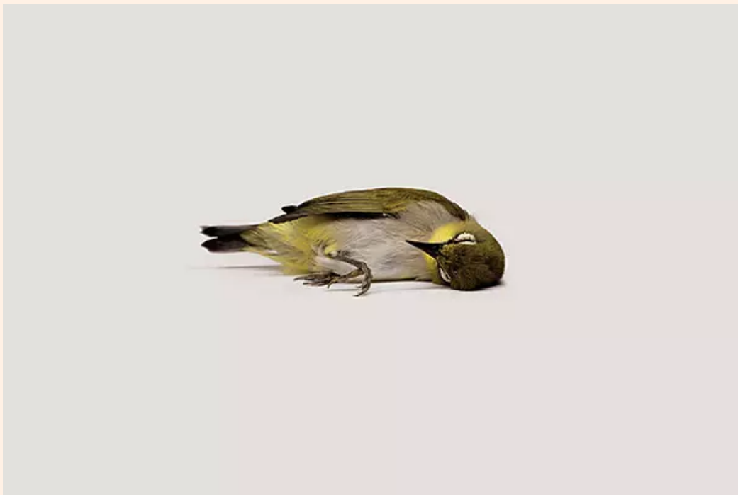
Oriental White-eye that died from light pollution

The specimens here are the result of, or under consideration for, some form of scientific modification.