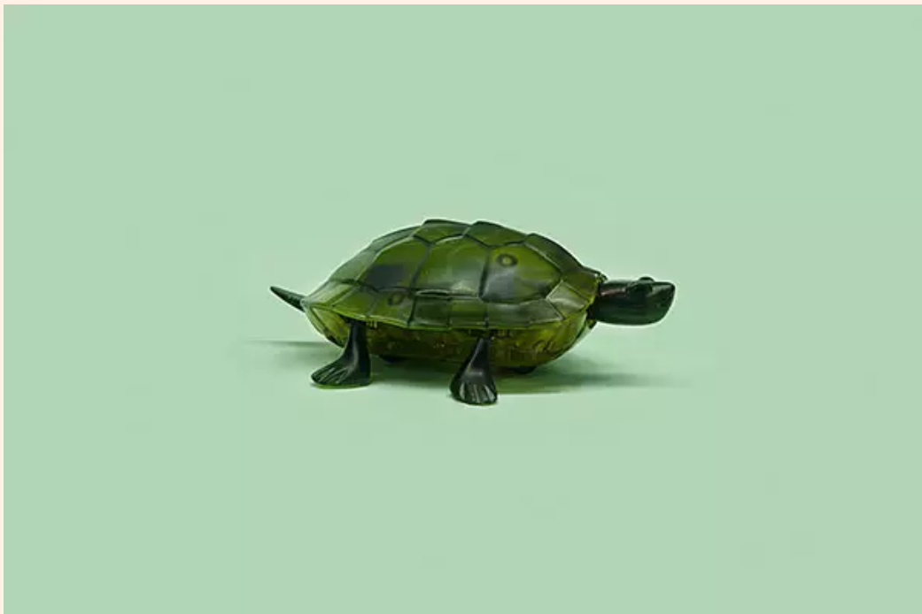
Zhou's Migration Turtle

So he created an alternative encyclopaedia in which a decorative aquarium fish can have right of place.