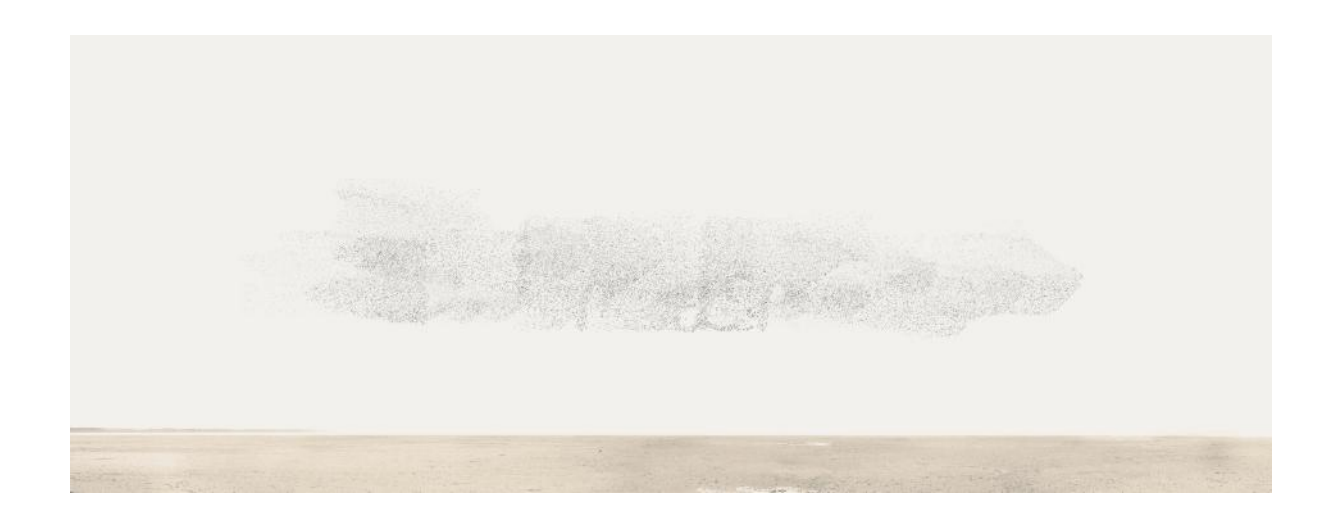
54321 Birds At High Tide 2019 Photograph | UV printed lightbox 150 x 400 x 12cm Edition of 3 + 1AP ZRH_5570