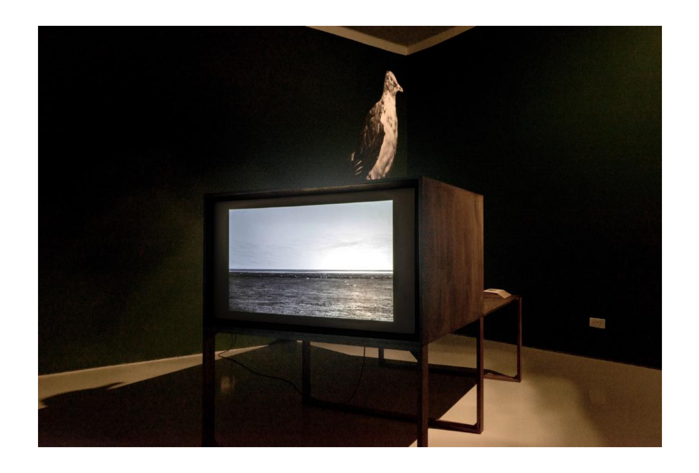
A Monument to Thresholds (Installation detail) ZRH_7389