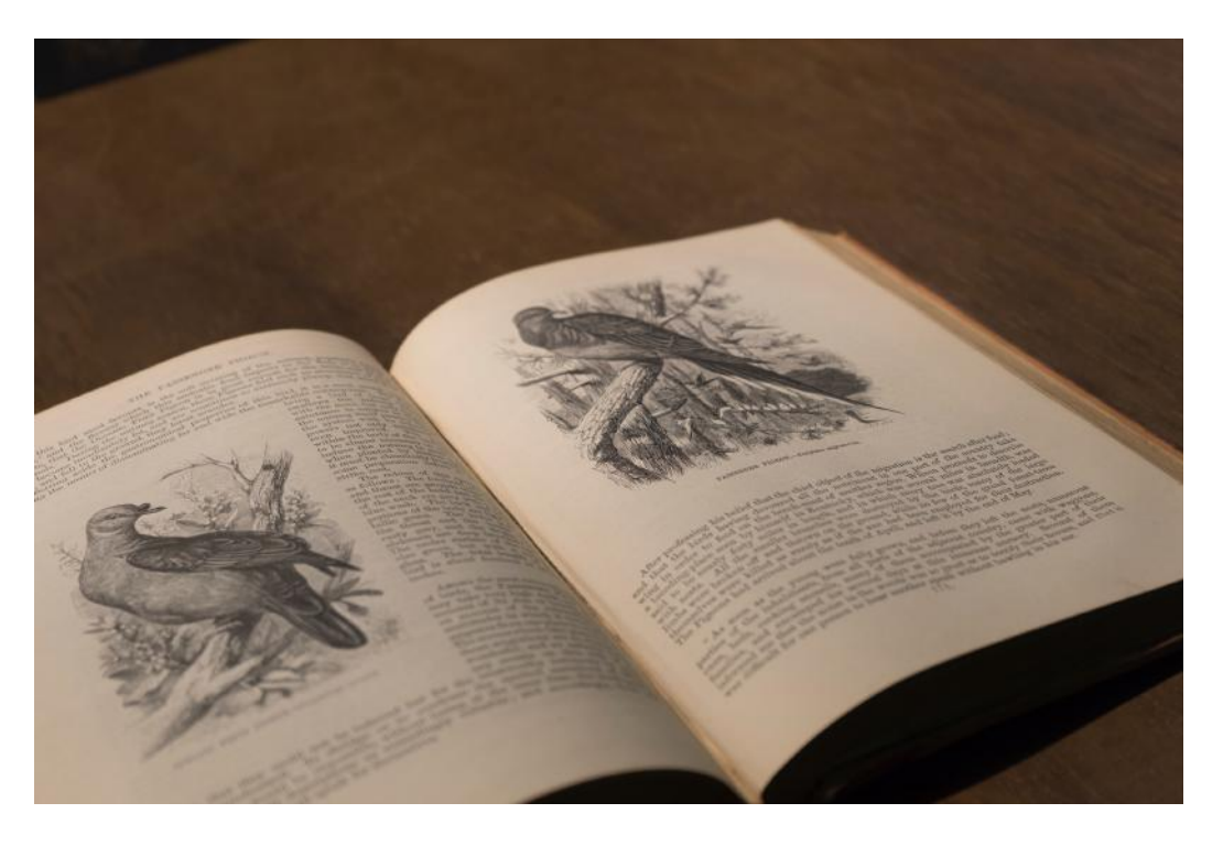
A Monument to Thresholds (Installation detail) ZRH_7389