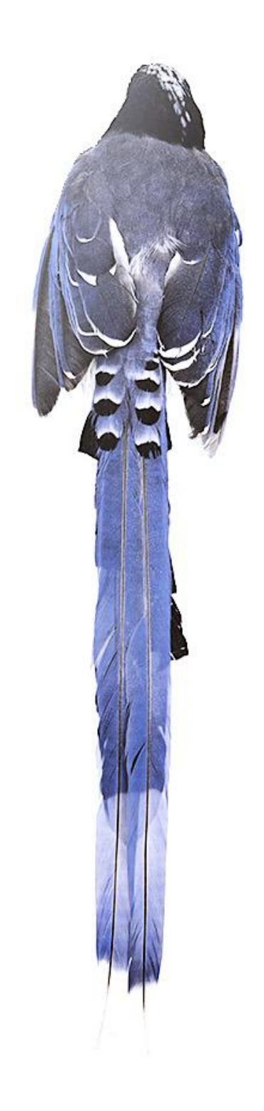
Disturbances (detail) 2020 Mix-media installation | Diecut print 120 x 26cm Edition of 1 ZRH_6050