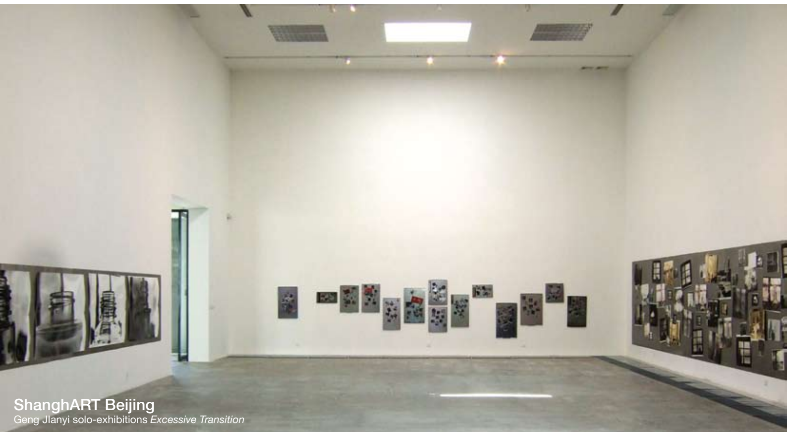
ShanghART Beijing Geng JIanyi solo-exhibitions Excessive Transition

ShanghART Beijing celebrates its opening with Geng JIanyi's 'Excessive Transition' solo-exhibition. The show consists of an entirely new series of expanded photo works that Geng JIanyi created in 2008. In these, mostly, black-and-white pictures the artist portraits objects belonging to his everyday reality, fellow artists, and rare glimpses of past scenarios. The various objects and settings have been slightly manipulated to create a feeling of uncertainty and distorted reality.