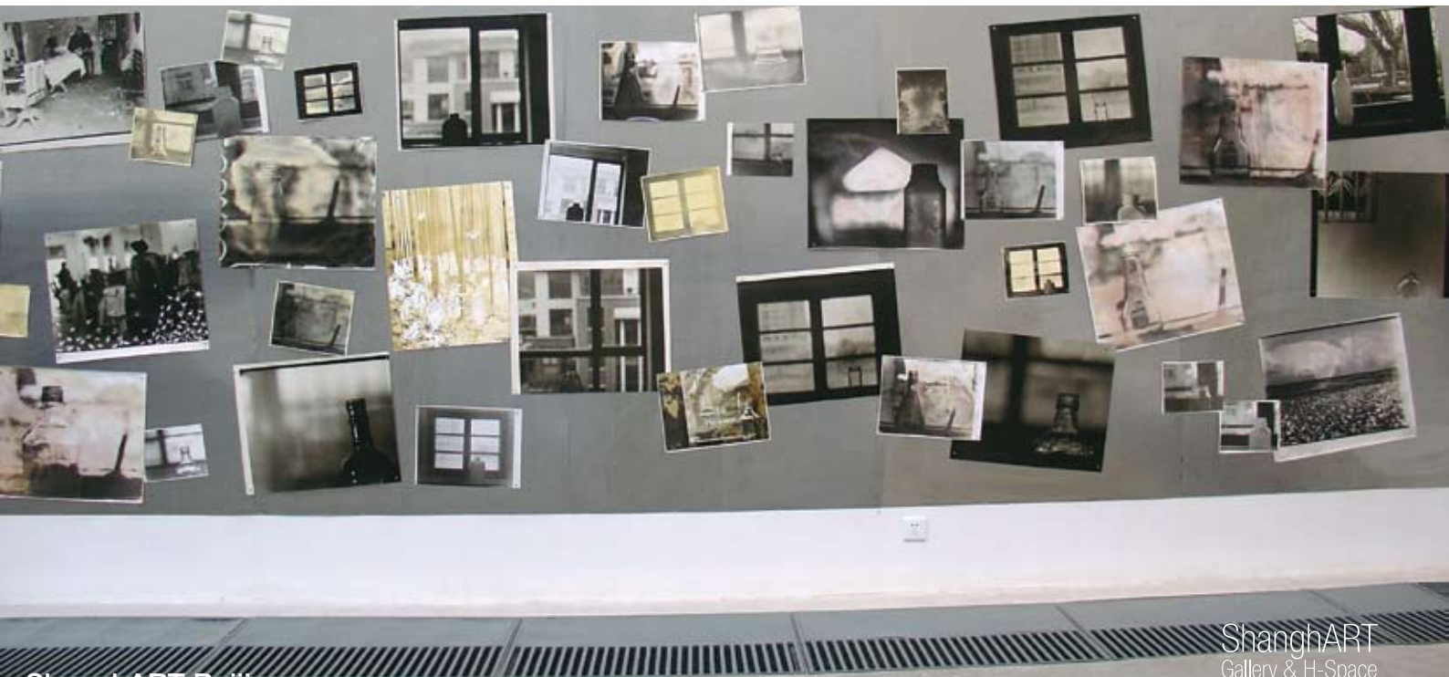
ShanghART Beijing Geng JIanyi solo-exhibitions Excessive Transition