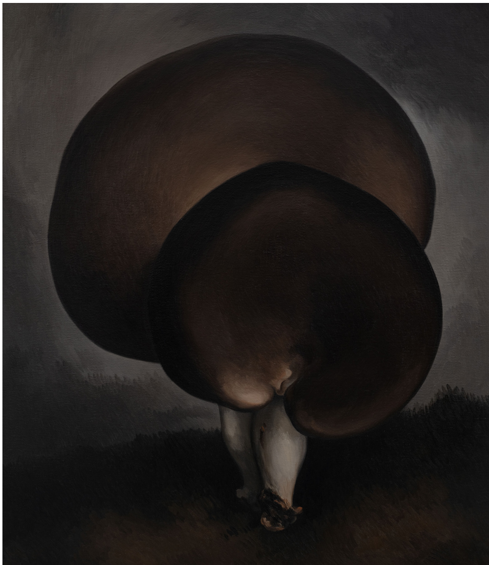
蘑菇 No.12 | Mushroom No.12, 2019 布上油画 Oil on canvas 150x130cm, YB_9921