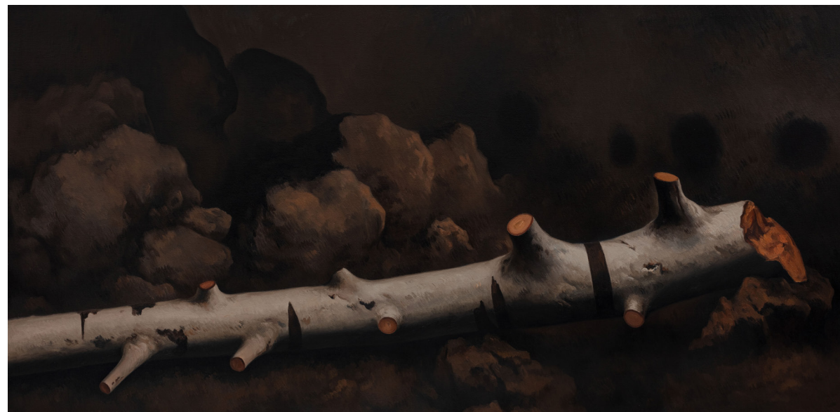
倒木 | Fallen Log, 2019 布上油画 Oil on canvas 165x340cm, YB_4333