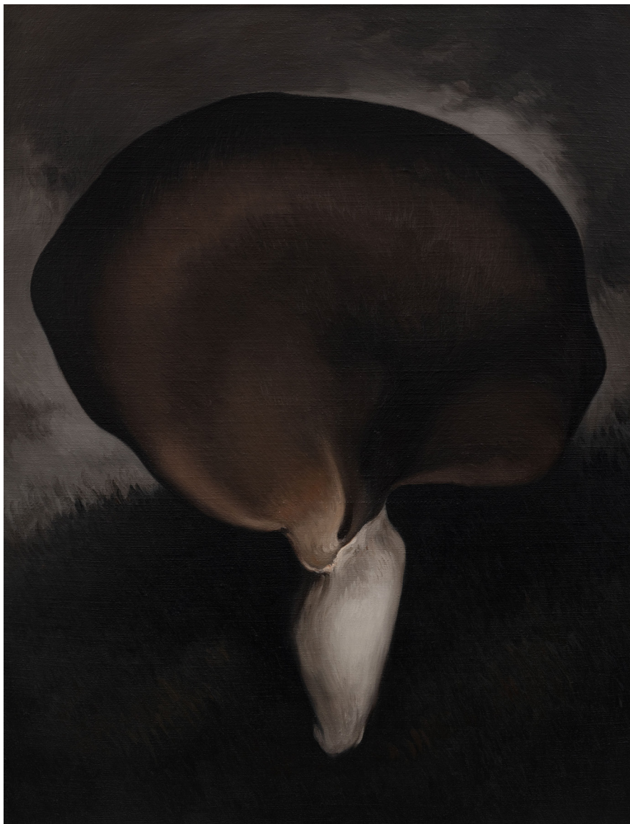
蘑菇 No.11 | Mushroom No.11, 2018 布上油画 Oil on canvas 130x100cm, YB_8002