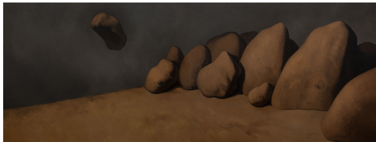
天涯 | Skyline, 2018 布上油画 Oil on canvas 150x400cm, YB_5651