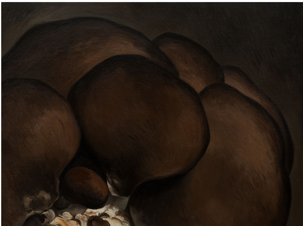
蘑菇 No.8 | Mushroom No.8, 2018 布上油画 Oil on canvas 60x80cm, YB_1389