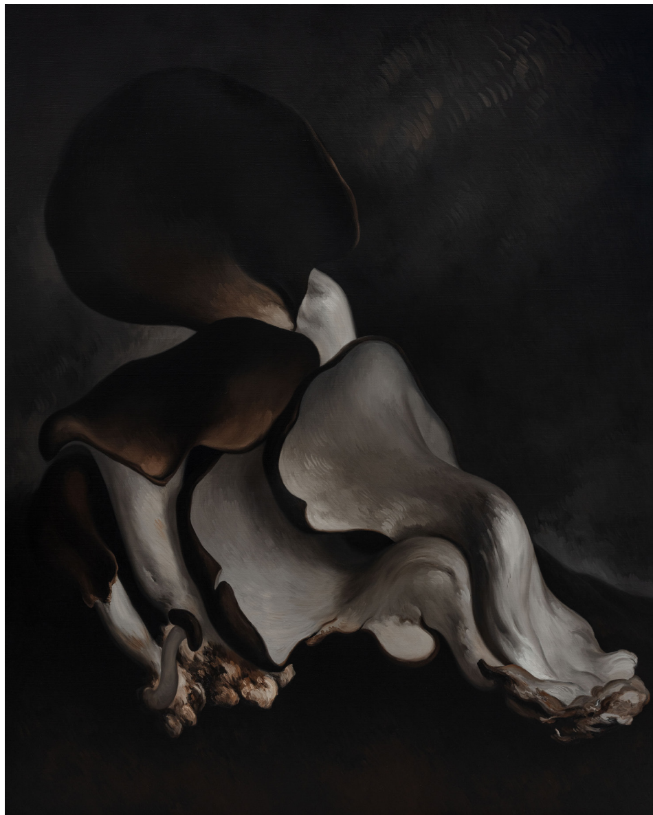
蘑菇 No.16 | Mushroom No.16, 2019 布上油画 Oil on canvas 250x200cm, YB_2548