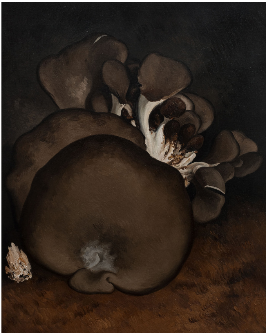
蘑菇 No.1 | Mushroom No.1, 2018 布上油画 Oil on canvas 150x120cm, YB_5678