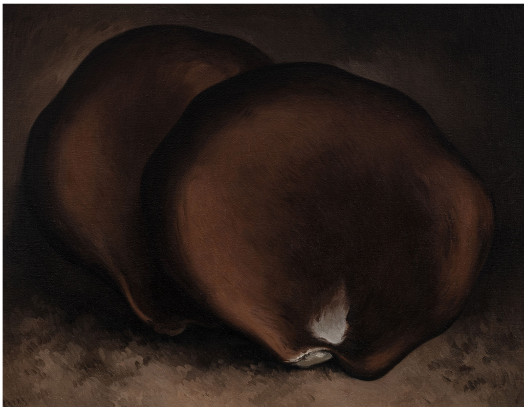
蘑菇 No.9 | Mushroom No.9, 2018 布上油画 Oil on canvas 100x130cm, YB_8330