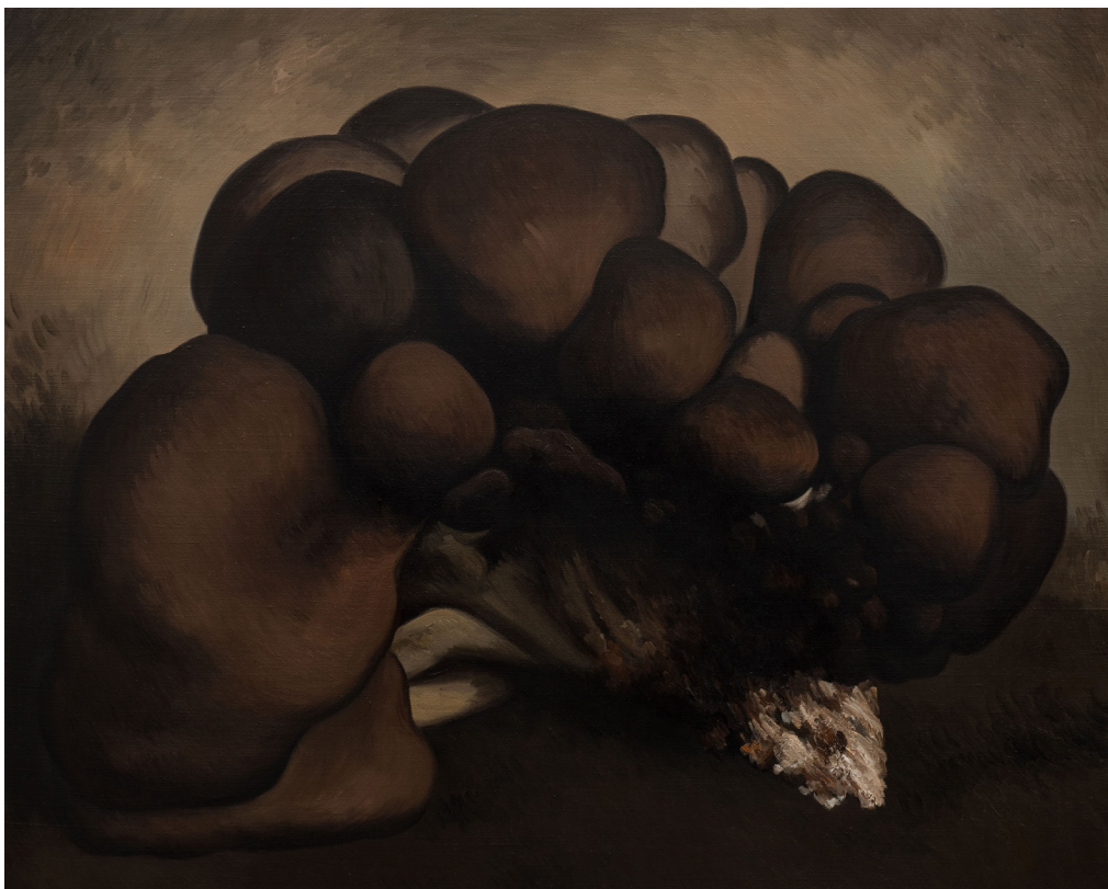
蘑菇 No.7 | Mushroom No.7, 2018 布上油画 Oil on canvas 120x150cm, YB_3518