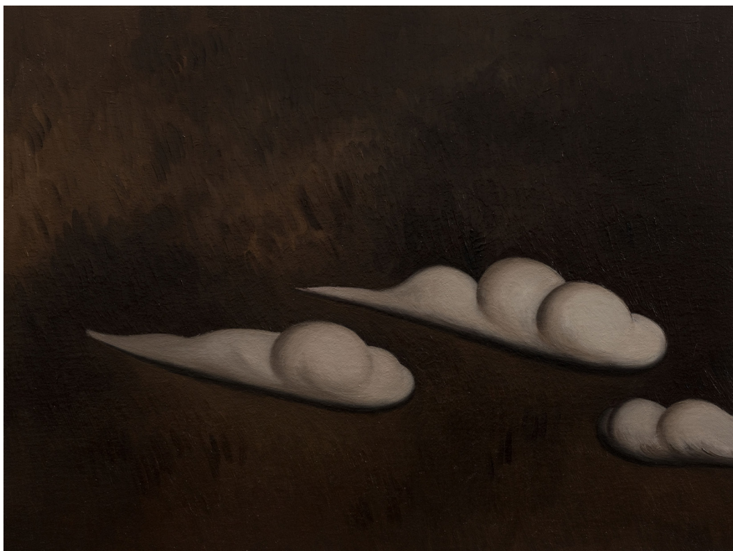
三朵白云 | Three White Clouds, 2017 布上油画 Oil on canvas 60x80cm, YB_9172