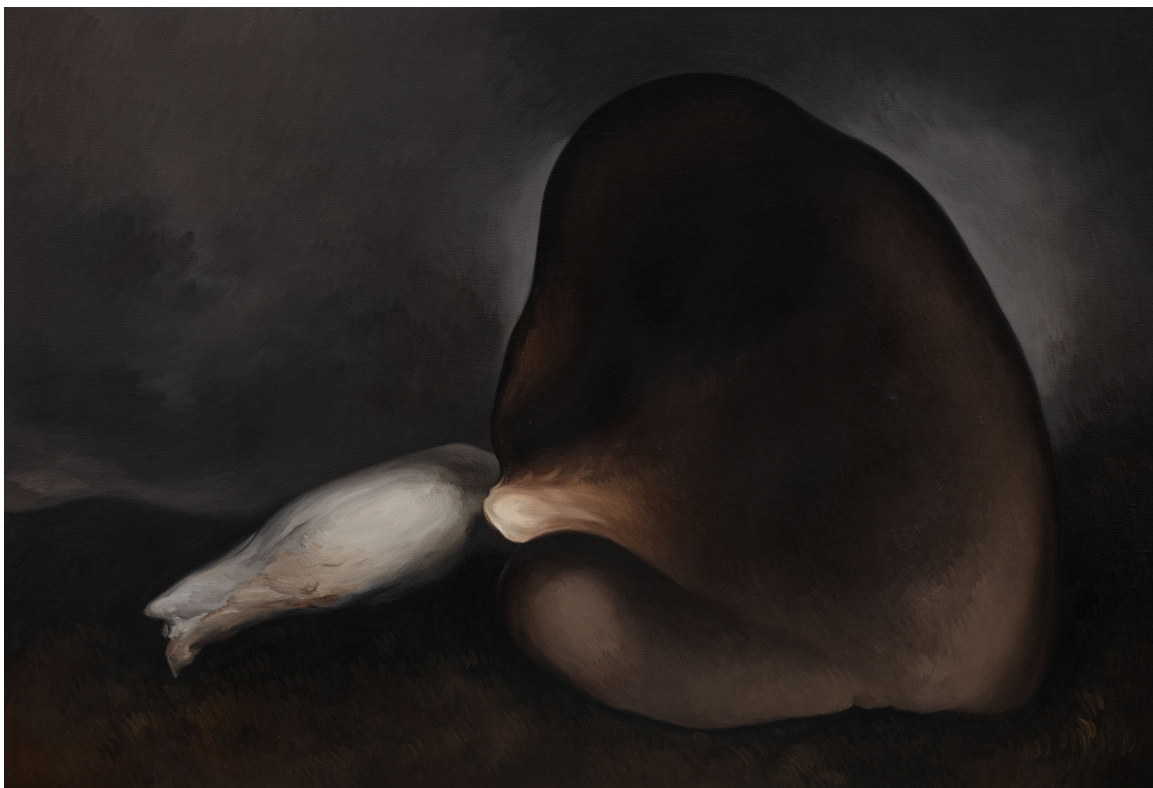
蘑菇 No.15 | Mushroom No.15, 2019 布上油画 Oil on canvas 150x220cm, YB_7175