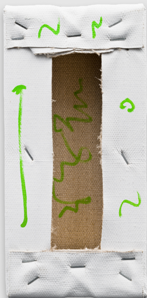
多角度视图 Multi-angle views