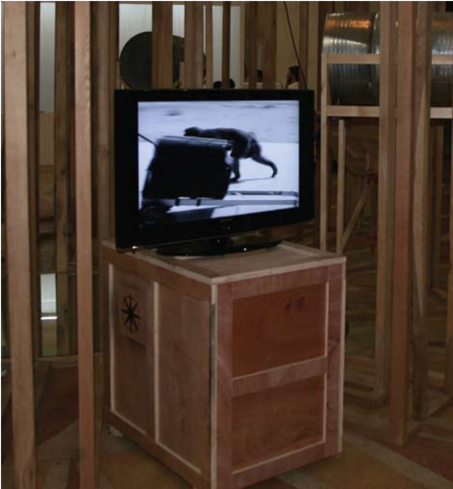
Video IX, 7'