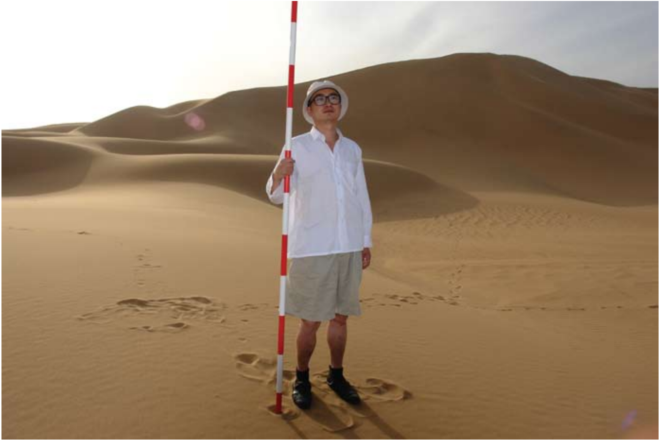
Video 1, 14'20"