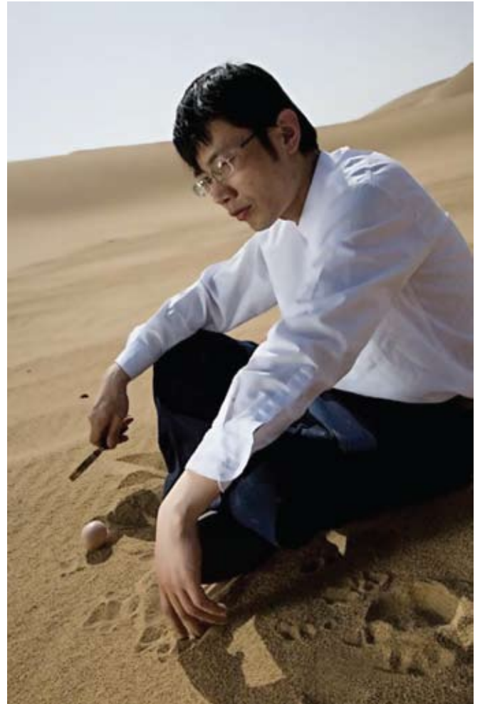
Video III, 7'30"