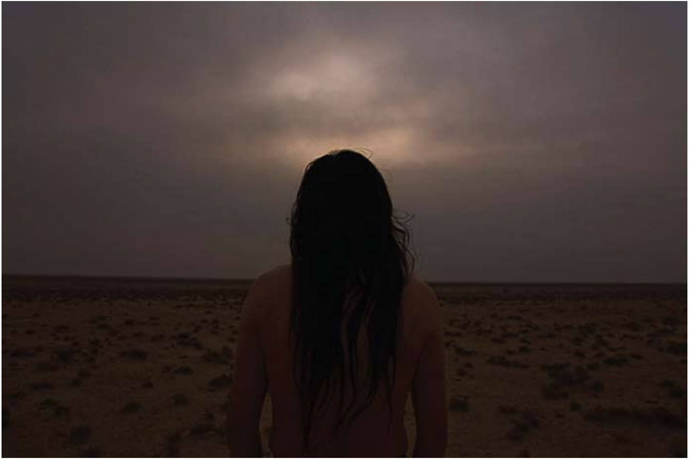
Video II, 7'20"