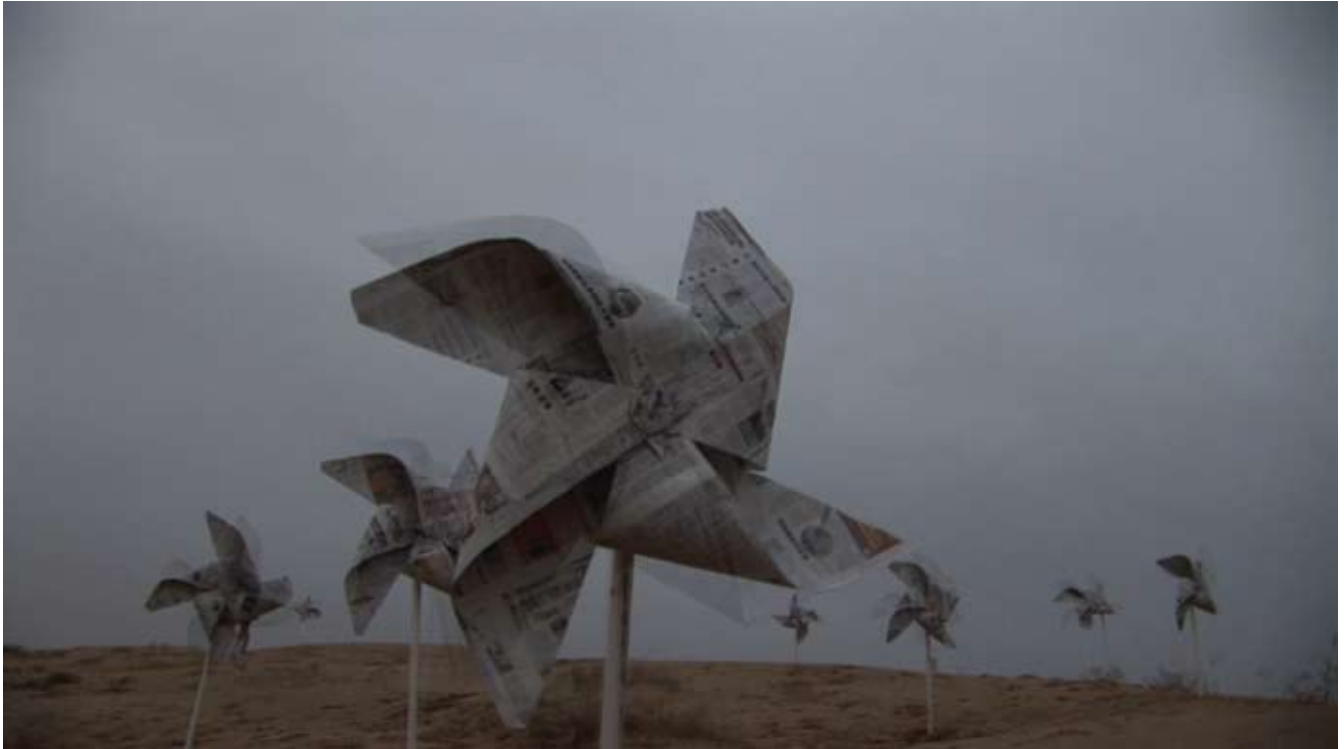
Video VIII, 22'