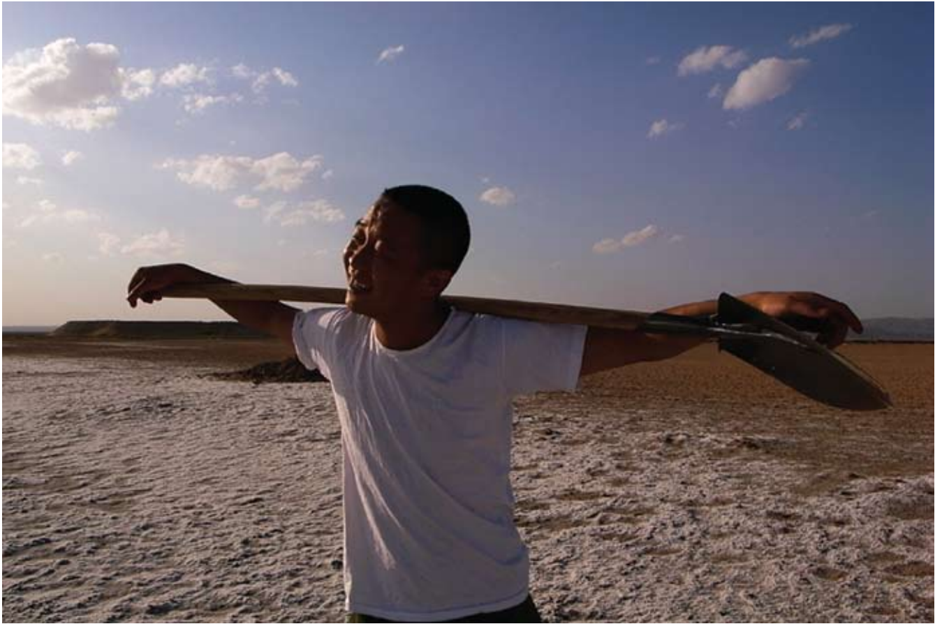
Video VII, 9'