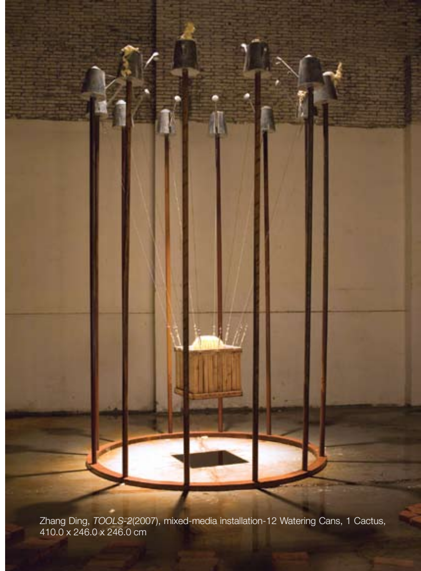
Zhang Ding, TOOLS-2 (2007), mixed-media installation-12 Watering Cans, 1 Cactus, 410.0 x 246.0 x 246.0 cm

"Tools" is an allegorical fairyland created by Zhang Ding to respond to this marginal world. Cactus here become the main props/tools, metaphor of a nidering and doggedly resistant life. We can see this plant anywhere, but their multiple thorns don't allow us to approach them. Zhang Ding fights against that, trying to find the possible ways of communication with this life, using violence or dialog? Cruel beating and frozen cutting don't destroy cactus as much as water, even though gentle and beautiful. Water pours from ten watering pots, lining out parabolas and hosing a cactus. Mud splatters around while the liquid spreads all over the floor. Beside this series of cactus is displayed a group of unnatural industrial products: 24 olive green refrigerators filled with loud-hailers, and an old style detonator which can trigger a deafening explosion noise, giving you a sudden feeling that you are in the world of the "Flowers of Evil".