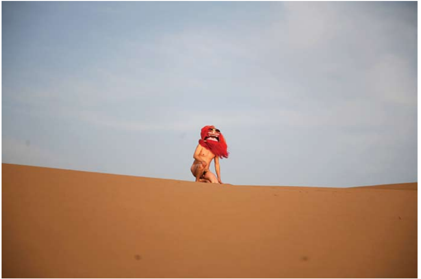
Video V, 5'