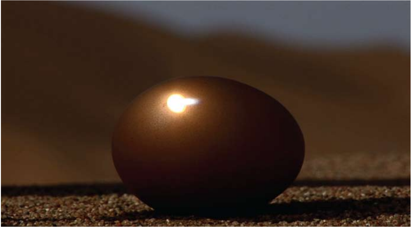
Video III, 7'30"