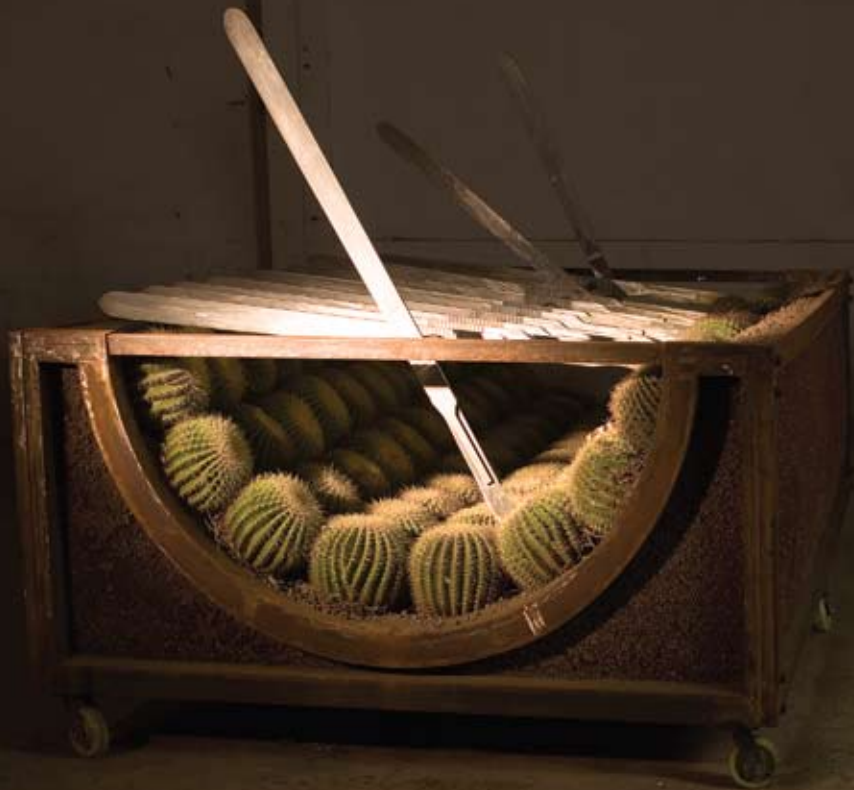
Zhang Ding, TOOLS-3(2007) , mixed-media installation, Mixed-media installation, 96 Cactus, Enlarged Scalpels, Flower Soil Box of Steel Structure, 410.0 x 246.0 x 246.0 cm