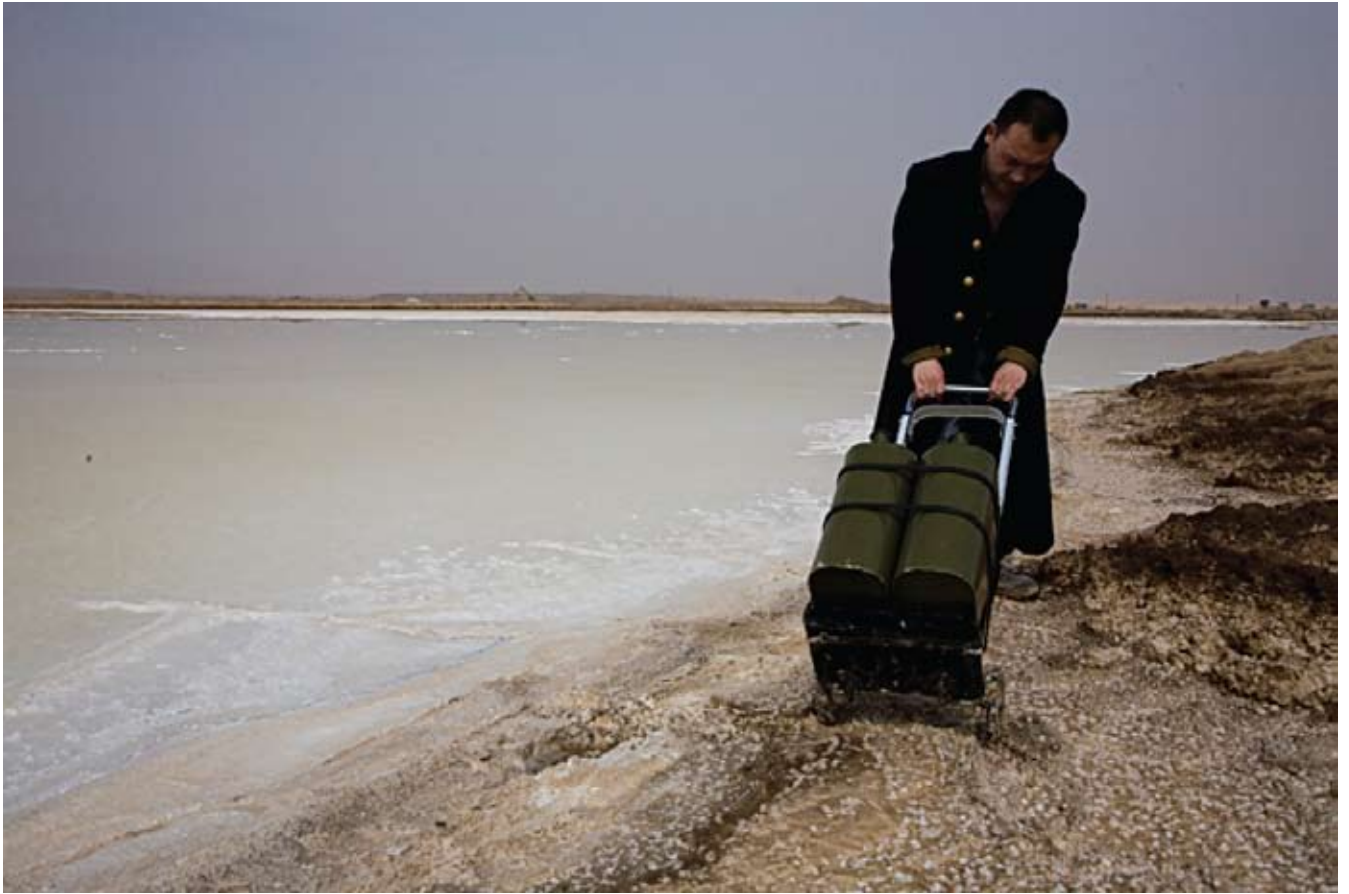
Video VI, 14'