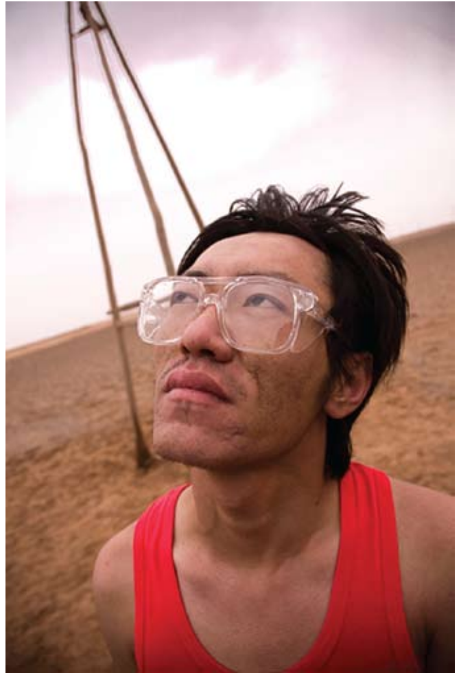
Video IV, 11'