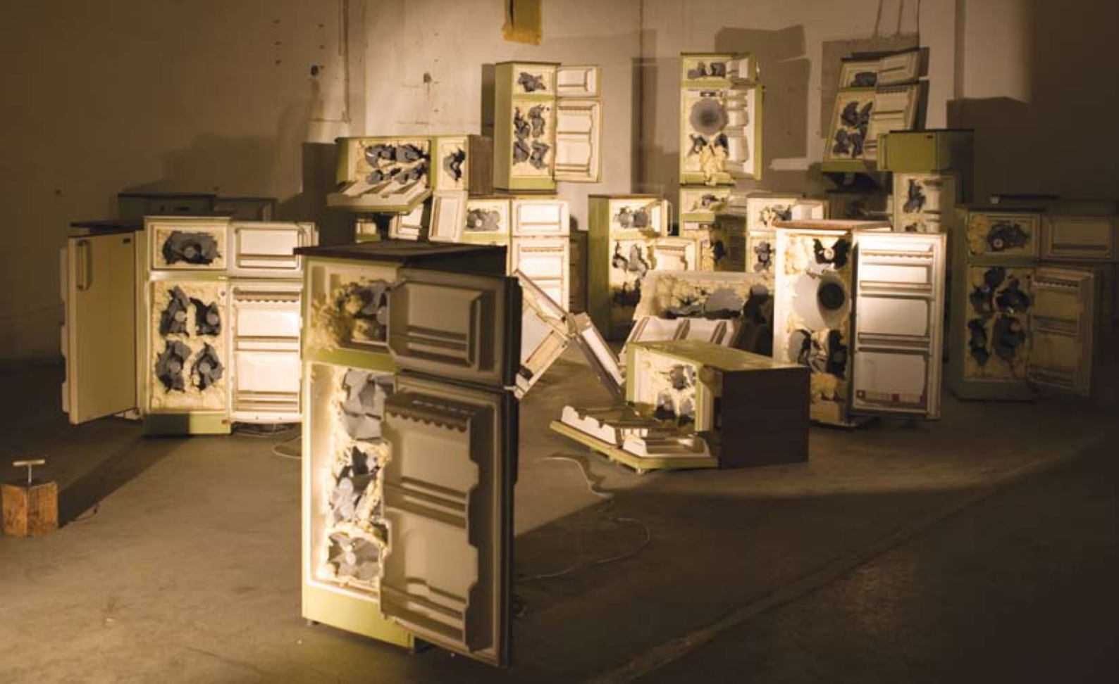
Zhang Ding, TOOLS-1(2007) , mixed-media installation, 24 Fridges