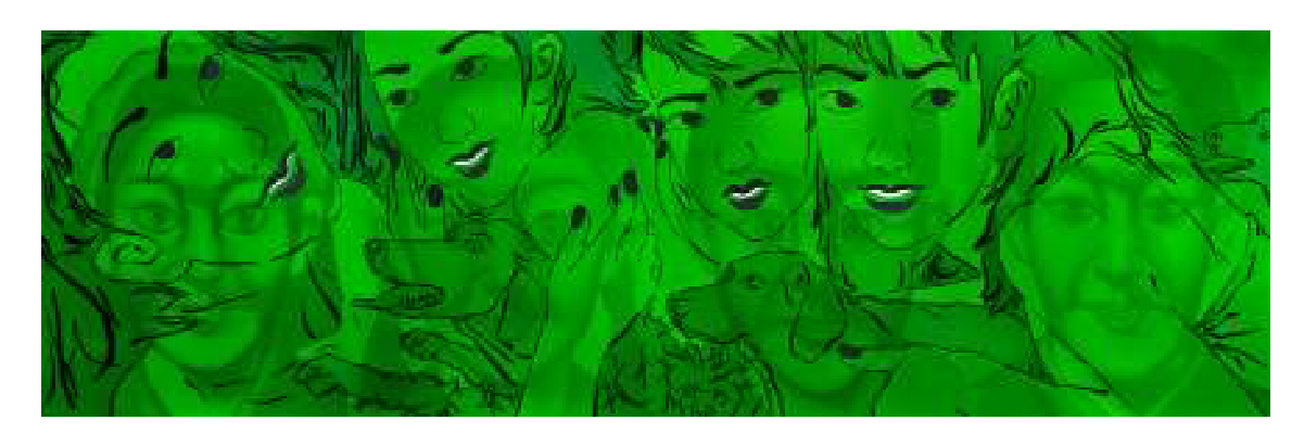
No.6, Pet(3), 250x800cm, acrylic, 2008

Pu Jie, however, draws a clear distinction between himself and most other Beijing artists who were lured by easy money, devoting himself to an artistic practice centered on his own individual worldview. He depicts a social structure that wavers between China's past history and its present-day contemporary developments, condensing his unique insights onto his canvases. Focusing on the urban context of the city of Shanghai, Pu Jie's paintings portray stories of contemporary residents of the city who live in the shadow of China's newly emerging histories. Installed in a vast 500m² space with ceilings measuring 4.5m high, this exhibition gives viewers an introduction to Pu Jie's painterly world, focusing mainly on his new large-scale works. Also opening on September 24 at the Beijing Today Art Museum is a solo show by Pu Jie that takes into account its continuity with this exhibition.