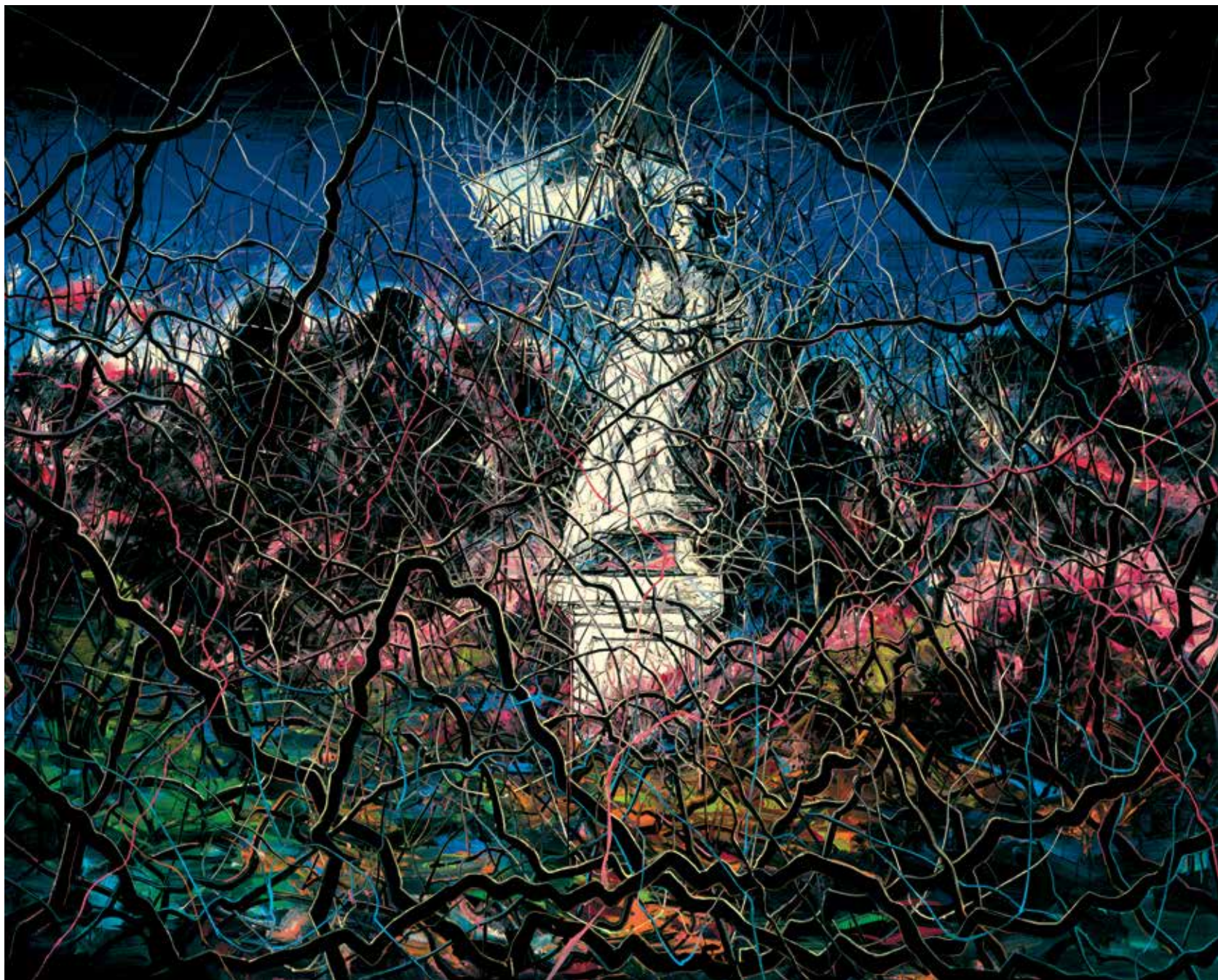
从1830年至今 No.2 | From 1830 Till Now No.2 | 297x370cm | 布面油画 | Oil on canvas | 2014