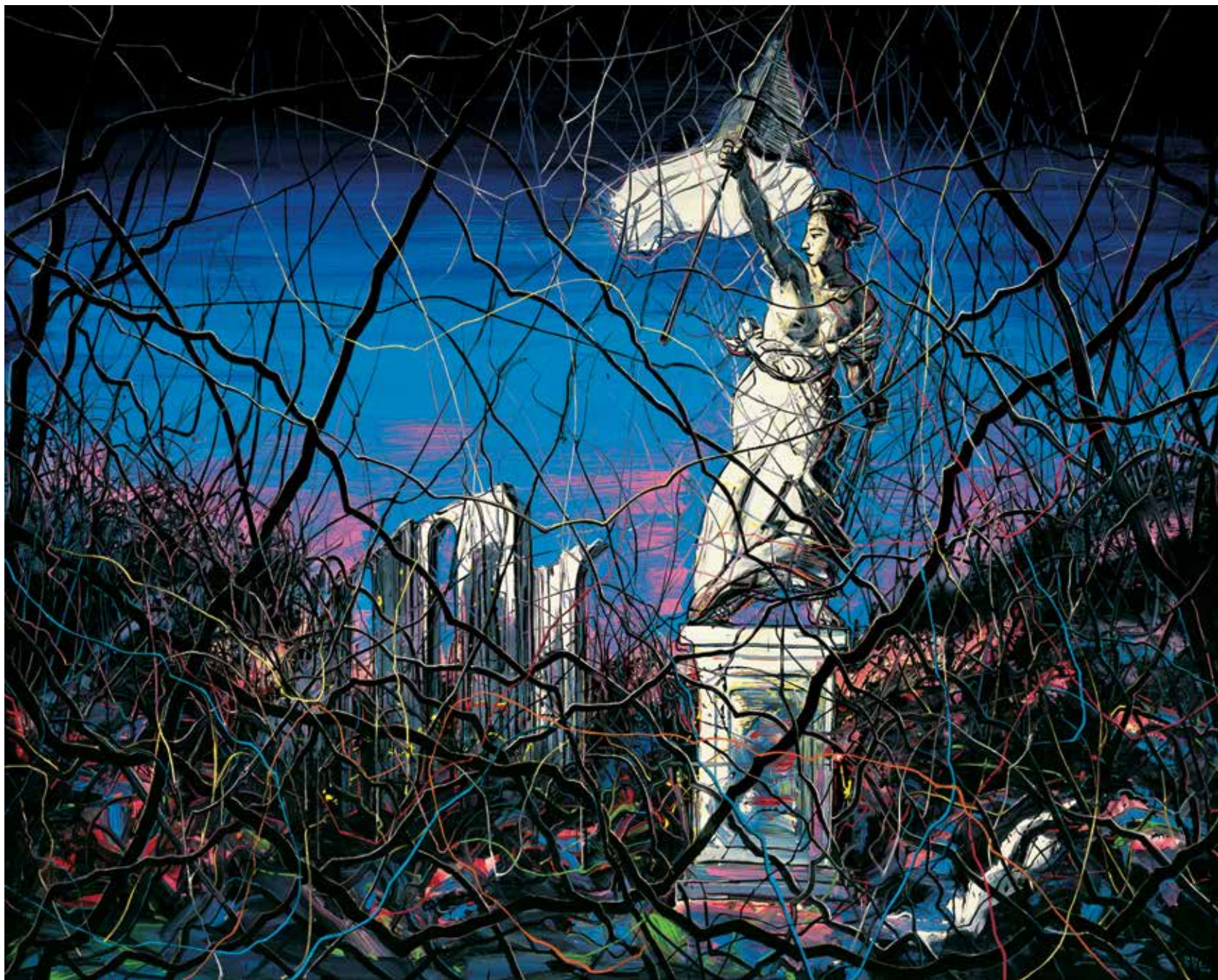
从1830年至今 No.4 | From 1830 Till Now No.4 | 297x370cm | 布面油画 | Oil on canvas | 2014