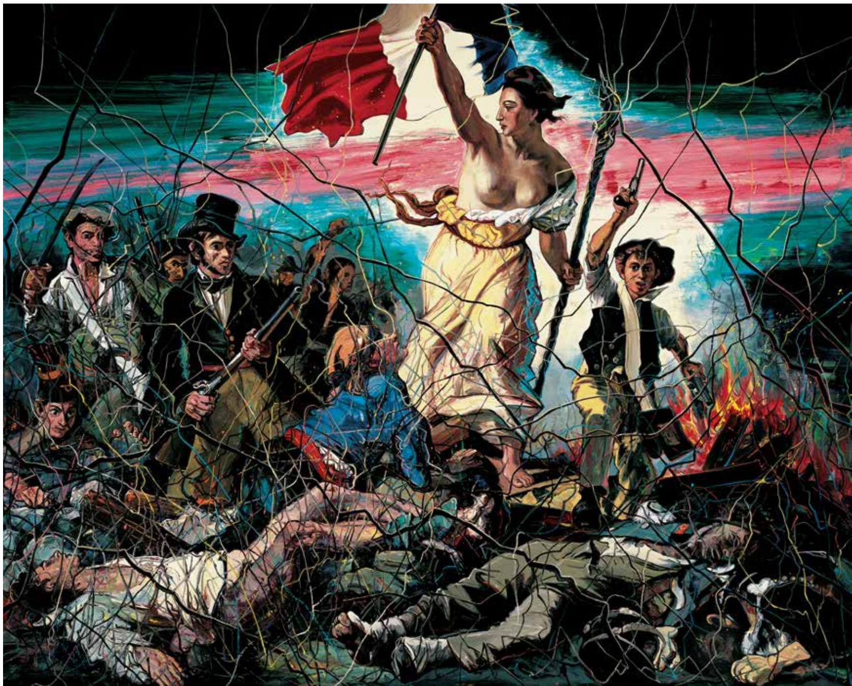
从1830年至今 No.1 | From 1830 Till Now No.2 | 297x370cm | 布面油画 | Oil on canvas | 2014