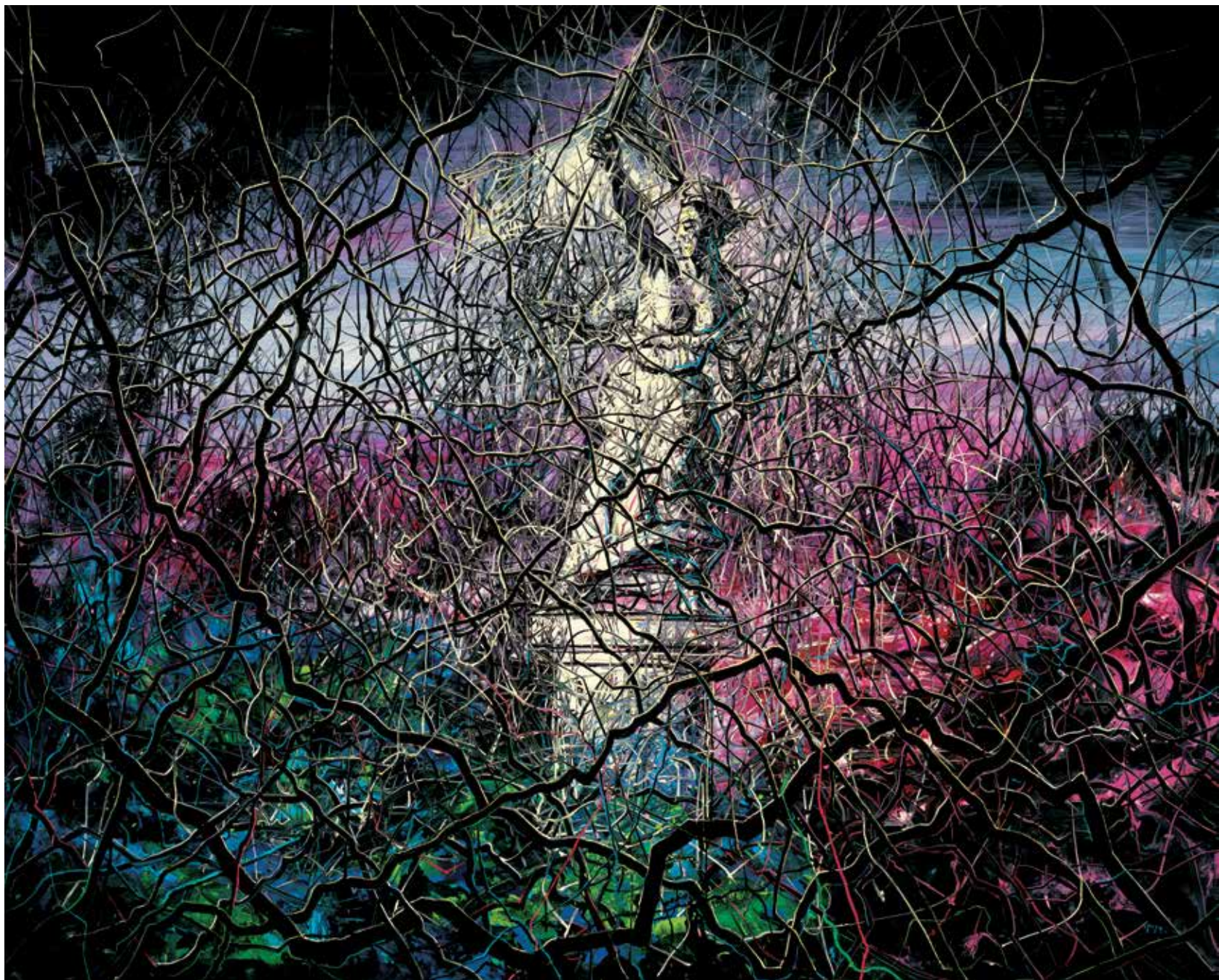
从1830年至今 No.3 | From 1830 Till Now No.3 | 297x370cm | 布面油画 | Oil on canvas | 2014