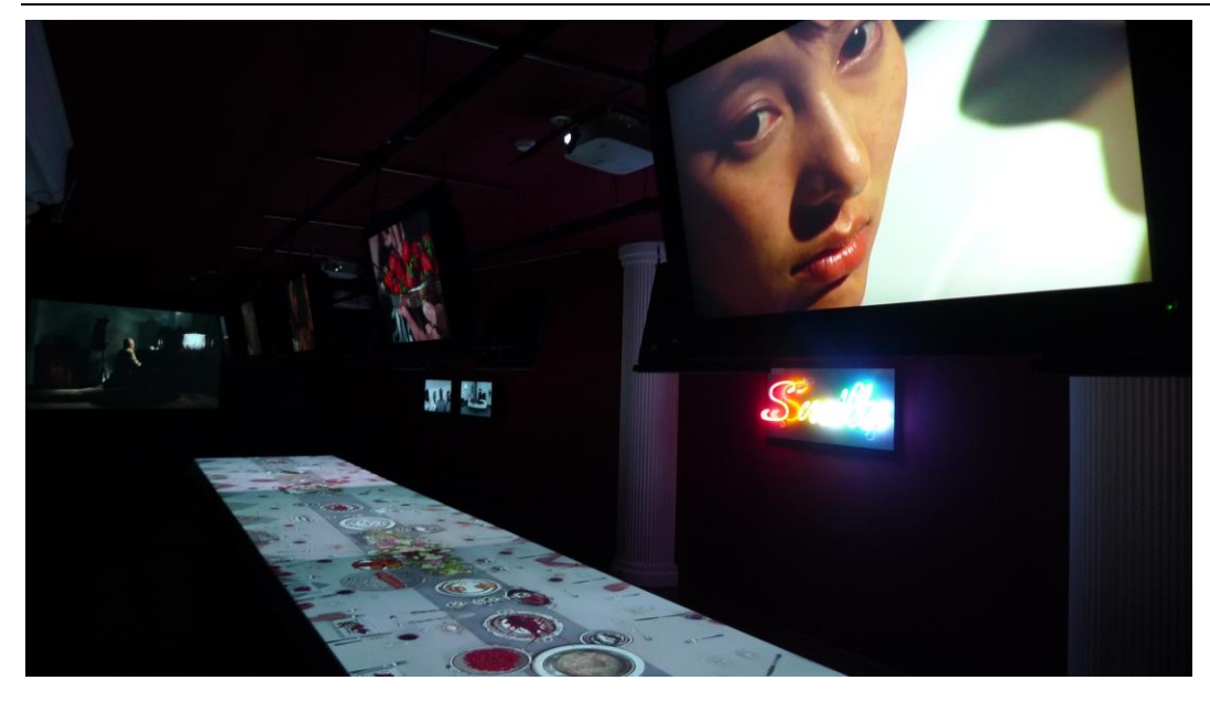
Yang Fudong, General' s Smile , 2009, video installation (Installation view in Hara Museum of Contemporary Art, Tokyo, Japan, 2009)