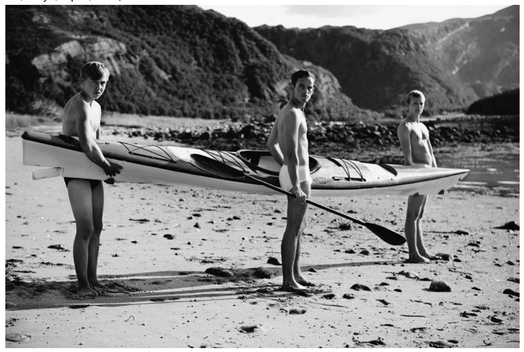
Yang Fudong, The Light That I Feel , 2014, 8 channel video installation, Sandhornøya, Norway, (Project commissioned by SALT 2014)