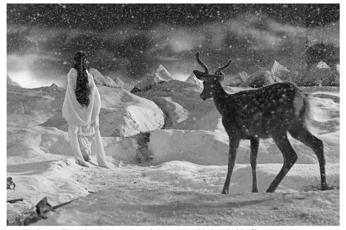
YANG Fudong, Yejiang/The Nightman Cometh, 2011, 35mm black and white film, 19min 20sec