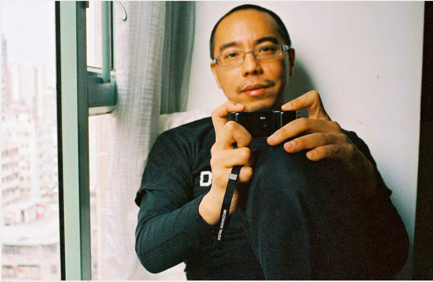
TOP: Apichatpong Weerasethakul. Photo by Chai Siris. COVER: Apichatpong Weerasethakul, Ghost Teen , 2009. Vinyl print. Courtesy of the artist.